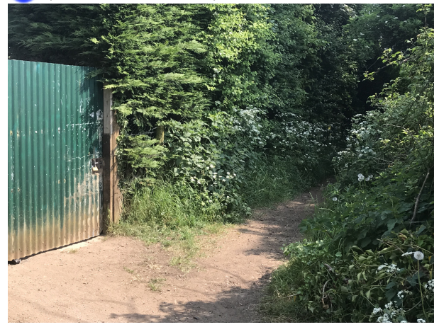
Ignore a path to the left and continue on past a large green gate.