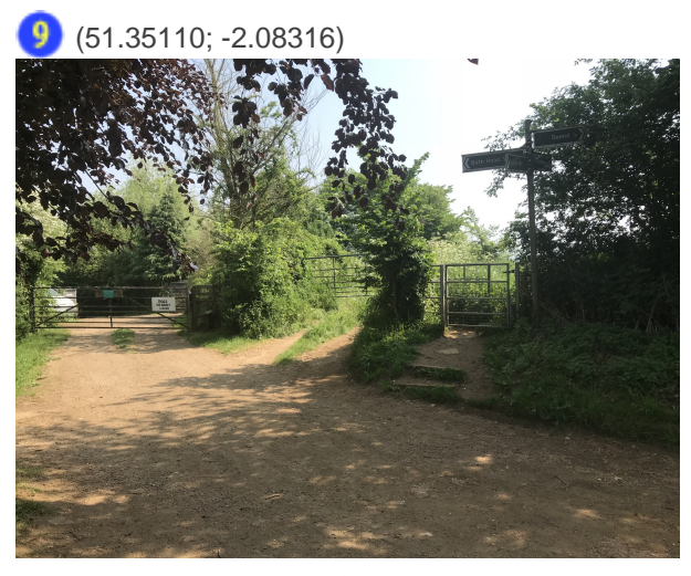
At a spiderweb junction of paths, take the immediate left, going downhill.