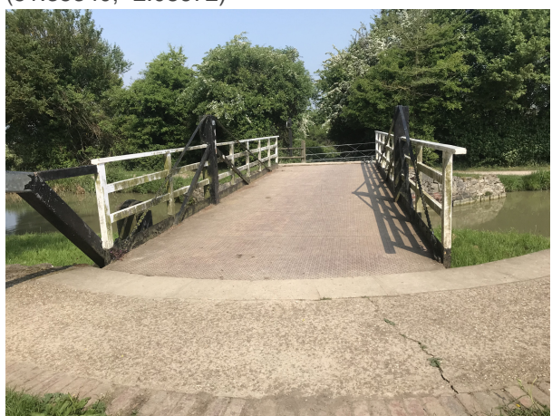
After about five eminutes, you're back at the canal. Cross over and retrace your steps from the beginning of the walk.