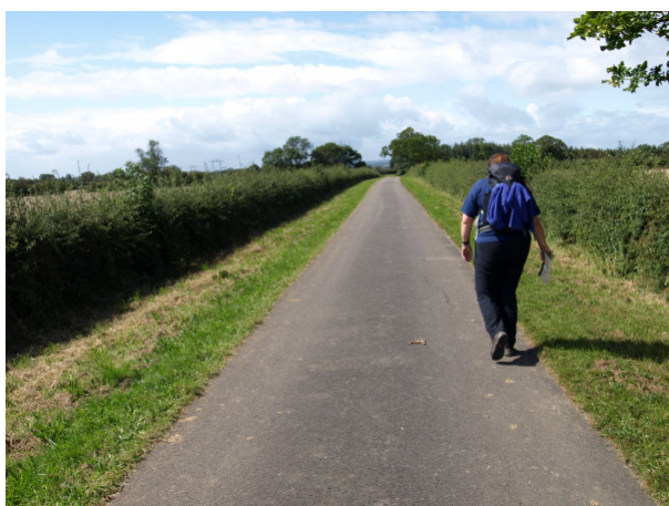
WALKING ON SHEAFLANDS LANE

START – Exit Boroughbridge Club Site past the barrier and go right at the road. Follow the pavement past the dairy. When it ends just outside Roecliffe Village continue on the road to go left past the school and reach The Crown Inn. Continue on the road past the pub to reach the track of Sheaflands Lane on your right. This is marked as a dead end.