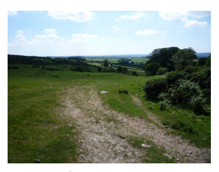
12. 6.3km/3.9 miles

At lane turn L then in approx 10 yds turn R at Moortown farm sign.