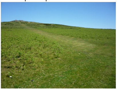
7. 3.6km/2.25 miles

Cox Tor. Enjoy magnificent views on a clear day.