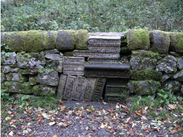
BOOK END SCULPTURE