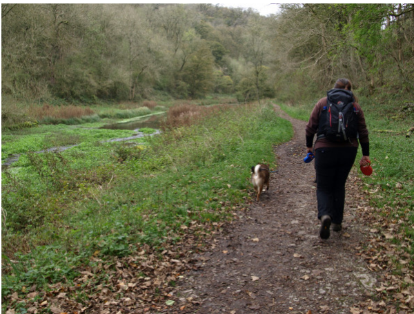
WALKING BY THE RIVER BETWEEN POINTS 2 AND 3