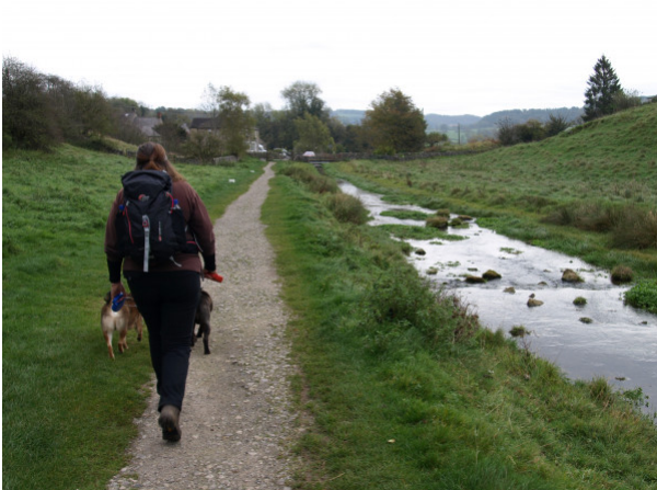
WALKING BY THE RIVER ON THE OPPOSITE SIDE