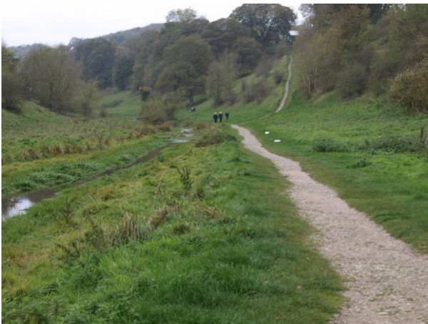
VIEW OF THE RIVERSIDE WALK DOWN THE VALLEY