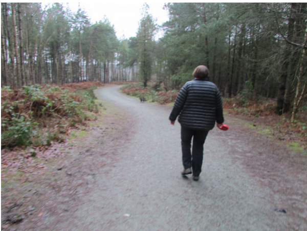
Walking near the start

2 - Pass through the car park to exit via a barrier. Take a path into the forest. As the track bears left, at a track crossroads, go left. Descend into a dip and reach a junction on the left at marker post 21.