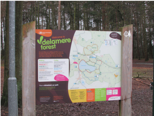
Sign in Delamere Forest