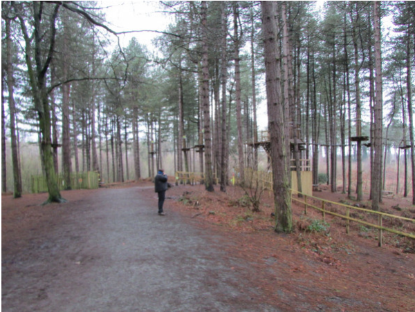
At the Go Ape site

Continue through the Go Ape area on a good path. When you reach a track junction facing the lake of Blakemere Moss, go right passing a marker for the red route. Follow the track with Blakemere Moss on your left. At a junction of tracks near the end of Blakemere Moss leave the Red Route turning right and climb to a barrier. Pass by it and cross the road carefully. Take the track beyond into Whitefield car park.