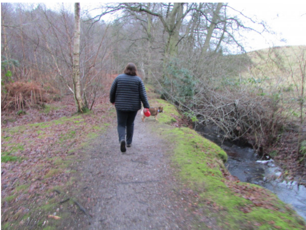
Walking by the stream on the return

Exit Delamere Forest Club Site via a kissing gate between pitches 12 and 13 and enter the forest. Go left and after the site ends continue along a fence with the railway line on your right to follow an undulating path to reach the Go Ape facility. Turn right in front of it and walk down the other side of the building.