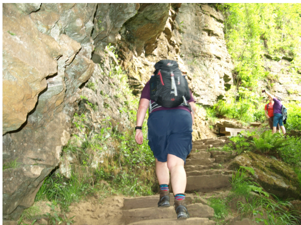
HARESHAW LINN FROM BELLINGHAM CLUB SITE