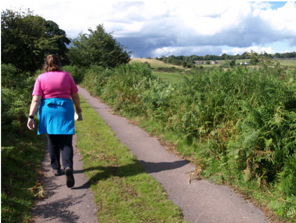
AN OPEN PART OF THE ROUTE

This walk explores a deep valley near Alton The Star Camping and Caravanning Club Site. The route is circular and has some steep ups and downs so wear good boots. The way is on paths, tracks, access tracks and lanes and these are well defined, although there is one section where the path is a bit vague. There is some thick forest walking and some great views as well so save the route for a sunny day of settled weather. If using a GPS the mileage will read 4.75 miles and the walk should take you about three hours at a steady pace. Take along Ordnance Survey map Explorer 259 - Derby, Uttoxeter, Ashbourne and Cheadle. In the forest section there are some fallen trees that have to be passed and if doing the walk in summer take a stick along as one or two of the paths get a bit overgrown.