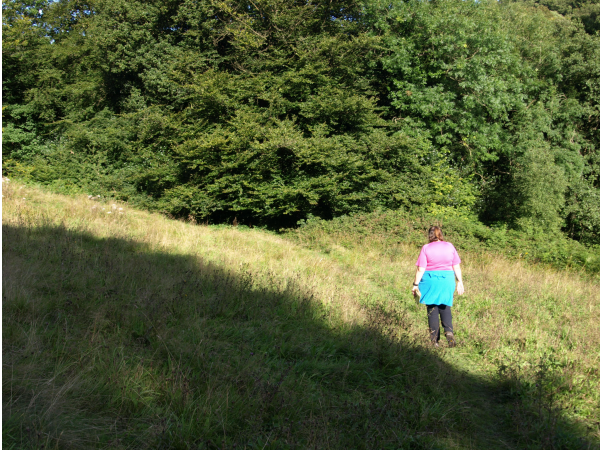
A WALK FROM ALTON THE STAR CLUB SITE