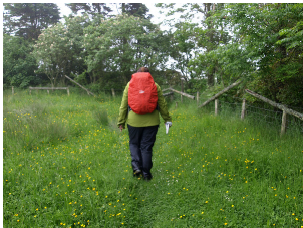
SHORTLY AFTER THE BRIDGE

going right through a gate after a while. Go left continuing by a wall to cross a stile. Cross a field crossing a stile. Cross the next field crossing a stile left of a high wall. Follow the line of the wall over the field to cross a stile, pass through trees and cross another stile to a road. Cross carefully, go right taking the next turning left. When the road bends left at a pub go right. At a 'T' junction go left then right taking a footpath for Beadnell Harbour. When the road bends left go straight on through two gates to cross a field picking up a fence on the left. Continue through a kissing gate to a road on a caravan site. Go left continuing past a barrier back to pass a car park on the right.