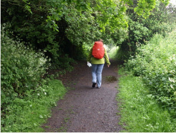
THE TRACK FROM THE COACH PARK