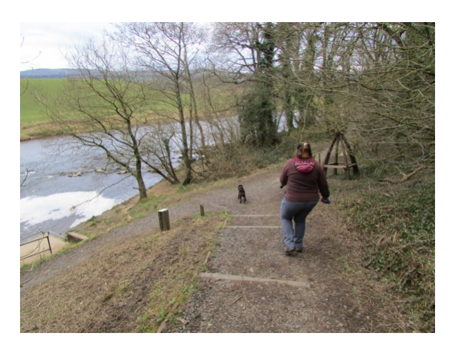
Walking by the River Ribble near Clitheroe

1. From the reception at Clitheroe Club Site exit past the barrier to the approach road. Go straight ahead for a few paces then go left (signposted Footpath To River Bank) just before the 5mph sign. Bend back sharply to the left and head downhill between some bushes. Drop down to a track by a play area and go left over a little bridge before turning right near a kissing gate. Follow the path to reach a surfaced track by the River Ribble. Go right on this, passing below a play area with the river to the left.