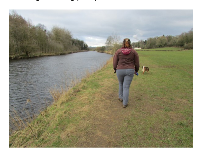
Following the River Ribble

Bear left on a path and cross a stile, heading left and crossing a bridge by a post. Go straight ahead to climb the next field, crossing a stile to the left of a short tree. Pick up a part-surfaced track and follow it beside bushes to pass through a gate by an old stile. Descend and bear right and join a track coming in from the left. Go ahead on this following the rising path past a farm and follow the access track to reach a road via a gate/opening.