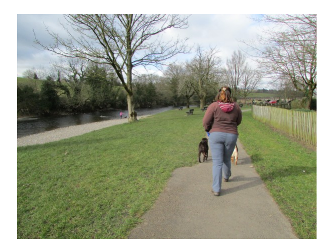
Walking to Edisford Bridge near the start of the walk

2. Follow the access lane for the sports centre past a barrier. At the end of the access lane continue straight ahead over a field to reach a sign for the Ribble Way. Go right near the river. Just before the path descends into trees, leave it to the right to follow 'footpath' and 'Ribble Way' signs past a dog bin and between houses, continuing down a short lane. At the end of this go left and then right in front of Cloggers Cottage. At the next junction go straight ahead and ahead again at a sign for the Ribble Way. At the next junction (with Union Street') continue ahead through more houses.