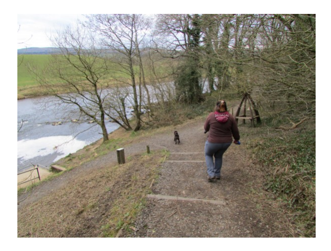
Descending to the River Ribble near a weir

3. Go right up the road and shortly cross over near a white house following the Ribble Way to the left through gates by a sculpture. Take the track beyond, turning half right at a junction for Brungerley Park. The track climbs up past a Ribble Way sign, continuing ahead at the next junction. Follow the path high above the river and at the next junction (just after a bench) go half left down some steps. At a junction near a weir go right over a little bridge and continue by the river. The path rises then turns left on a wide track by a Cross Hill Quarry sign. Follow the river to go left on The Ribble Way at an otter sculpture.