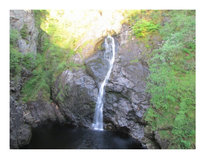
Lower Foyer Falls

1. From reception at Loch Ness Shores Club Site leave the site past the barrier. Drop down and bear right on the approach road passing beneath the Club Site back into Lower Foyers. Continue ahead when the track becomes a lane and walk past a phone box to a bus stop. Go left here, continuing up a road with a forest to the left and houses on the right. When the road bends right go ahead into the woods bearing right and rising beneath houses. Continue ascending and carry on ahead on an access track. Bend left and right and then turn left at the next junction past a sign for Foyers Mains. Pass through a gate/opening and follow the track as it rises and bears left past a seemingly derelict house. Bend right in front of a white house and pass the side of the derelict house. Curve left on the track passing Merther Mains House. Go straight over at a junction by the house and continue towards the forest ahead, passing through a large gate to reach it.