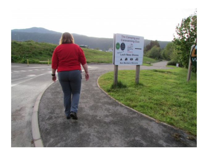
The way back to the Club Site

7. Follow the path to reach a surfaced lane and go left on it to descend through trees to reach a road. Go left downhill on the road. Continue descending and bend left by a sign for the power station. Descend into Lower Foyers and cross a bridge over the river. Here go right on your outbound route to follow the road and then an access track back to the Club Site near Loch Ness.