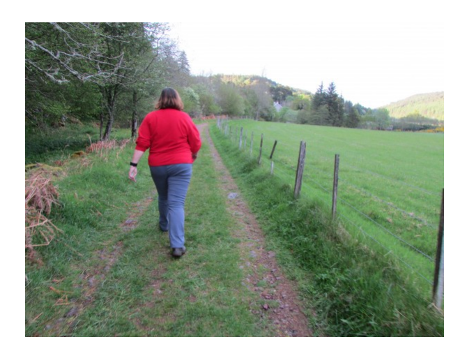
The track after entering the forest

2. Take the Yellow Route ahead bearing right past a marker. Stick to the track as it rises into the forest and stay ahead on the marked Yellow Route at a junction. The route climbs upward near some telegraph poles and overhead wires and higher up it climbs more steeply. Keep to the track. Bend left with the track past a Yellow Route marker and reach a junction on the right as the angle eases. Go straight ahead to descend past a Yellow Route marker and continue descending to reach more level ground at another junction marked with both a Yellow Route post and a Red/Yellow Route post. Go left past the Red/Yellow route post and pass through a large deer gate. Follow the track on the forest edge keeping a fence on your right. Continue on the track to eventually bear right over a bridge by Upper Foyer Falls.