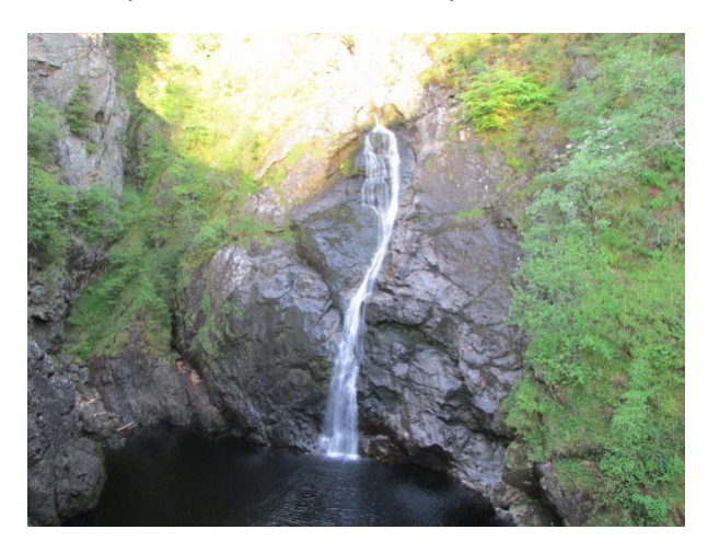
The Lower Foyers Waterfall

5. Retrace your steps back past the upper viewpoint and continue up to the path junction passed earlier (where the path bends back to the right). Here leave your outbound route and carry on ahead following the To Path Network and Lower Foyers signs. Cross a bridge and next go left on a good track at a junction of paths. Cross another bridge and head downhill. At the next junction go straight ahead on the Blue path. Keep a fence left and follow the path zigzagging down with a gorge on the left. Descend the steps and pass a bench that overlooks the falls, then continue on to bear back to the right and pick up more descending steps. Continue down with the fence still on your left using a footpath and steps where available.