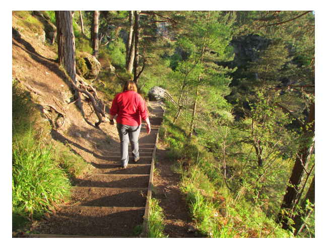
THE FALLS OF FOYERS