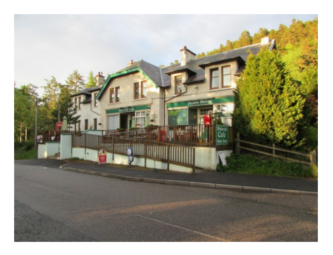
The Waterfalls Café and General Store

4. Go left through the leftmost of two gates and follow signs for The Falls of Foyers. Descend some steps to a path junction. Go left for the Falls of Foyers and descend more steps to another junction where the path cuts back to the right. Go straight on to reach the upper viewpoint for the falls. Return to the main path and go straight on before dropping down and cutting back to the left to the lower viewpoint.