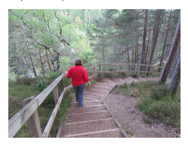
The way back to Lower Foyers

5. Retrace your steps back past the upper viewpoint and continue up to the path junction passed earlier (where the path bends back to the right). Here leave your outbound route and carry on ahead following the To Path Network and Lower Foyers signs. Cross a bridge and next go left on a good track at a junction of paths. Cross another bridge and head downhill. At the next junction go straight ahead on the Blue path. Keep a fence left and follow the path zigzagging down with a gorge on the left. Descend the steps and pass a bench that overlooks the falls, then continue on to bear back to the right and pick up more descending steps. Continue down with the fence still on your left using a footpath and steps where available.