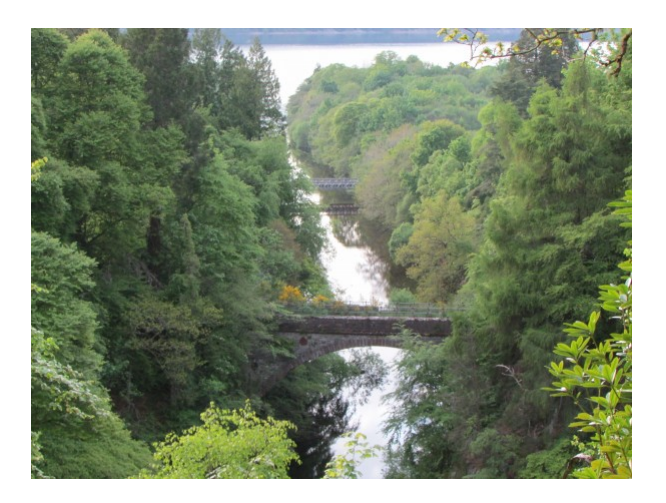
The viewpoint for the two bridges in Lower Foyers

7. Follow the path to reach a surfaced lane and go left on it to descend through trees to reach a road. Go left downhill on the road. Continue descending and bend left by a sign for the power station. Descend into Lower Foyers and cross a bridge over the river. Here go right on your outbound route to follow the road and then an access track back to the Club Site near Loch Ness.