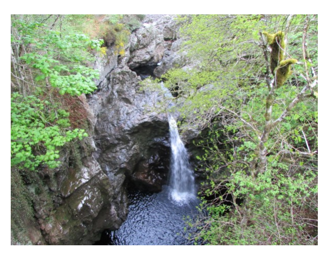
Upper Foyer Falls

2. Take the Yellow Route ahead bearing right past a marker. Stick to the track as it rises into the forest and stay ahead on the marked Yellow Route at a junction. The route climbs upward near some telegraph poles and overhead wires and higher up it climbs more steeply. Keep to the track. Bend left with the track past a Yellow Route marker and reach a junction on the right as the angle eases. Go straight ahead to descend past a Yellow Route marker and continue descending to reach more level ground at another junction marked with both a Yellow Route post and a Red/Yellow Route post. Go left past the Red/Yellow route post and pass through a large deer gate. Follow the track on the forest edge keeping a fence on your right. Continue on the track to eventually bear right over a bridge by Upper Foyer Falls.