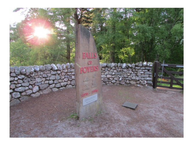
The entrance to the Lower Falls of Foyers