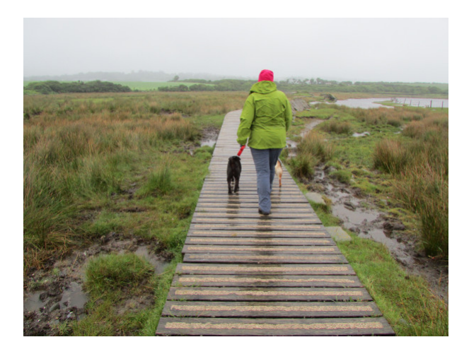
Walking on the boardwalk

path. Eventually pick up a board walk that takes you over marshy ground – follow it round to the right and pass through a gate.