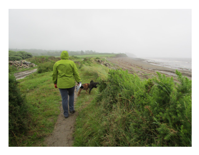
The footpath follows the sea shore

5) Proceed by the river crossing several little bridges. As the river reaches the sea, curve left to rise on the path and walk between banks of brambles and ferns to cross a bridge into more open ground.