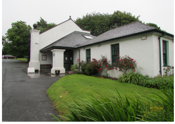
The Lloyd George Museum near the start of the walk

1) Exit the Club Site and turn right to walk up the hill. Continue ahead at a junction on the left (for the paintballing park) and descend into Llanystumdwy. Pass through houses and the church on the left and follow the road round to the right over a bridge using the pavement. Ignore a junction on the left and watch for a footpath/track on your right once over the bridge.