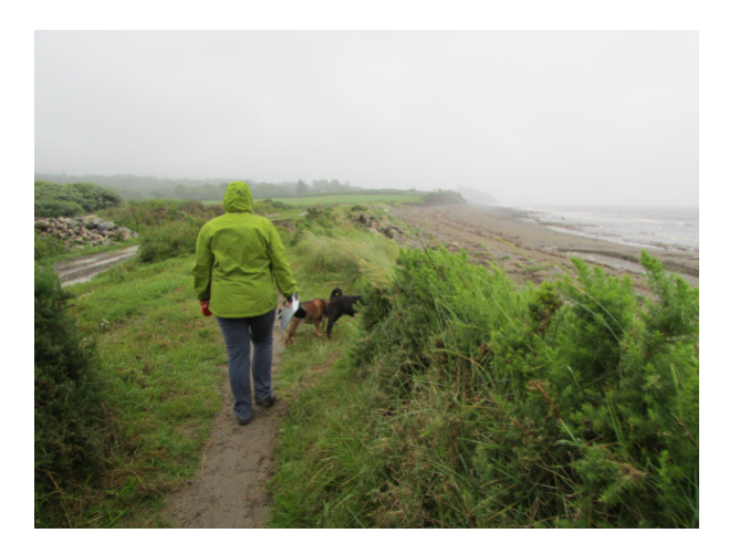
The footpath by the sea

7) Follow the rising path through some bushes to reach the walls of the white building and pass to the left of the house. Reach a marker post and go right to pass by the house. Proceed onto the Coast Path, which is the second path on the left as you pass the house and is the one nearest the sea. Continue along the path with the sea to the right to pass through a gate near a junction on your left. Keep ahead on the path heading towards Criccieth and passing some benches.