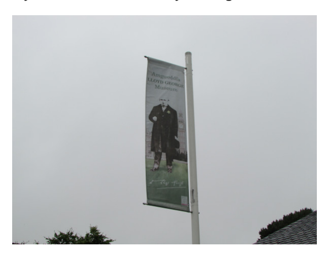
If you want to visit the Lloyd George Museum then continue ahead here to reach it shortly on the left.

1) Exit the Club Site and turn right to walk up the hill. Continue ahead at a junction on the left (for the paintballing park) and descend into Llanystumdwy. Pass through houses and the church on the left and follow the road round to the right over a bridge using the pavement. Ignore a junction on the left and watch for a footpath/track on your right once over the bridge.