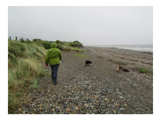
Walking on the beach

7) Follow the rising path through some bushes to reach the walls of the white building and pass to the left of the house. Reach a marker post and go right to pass by the house. Proceed onto the Coast Path, which is the second path on the left as you pass the house and is the one nearest the sea. Continue along the path with the sea to the right to pass through a gate near a junction on your left. Keep ahead on the path heading towards Criccieth and passing some benches.