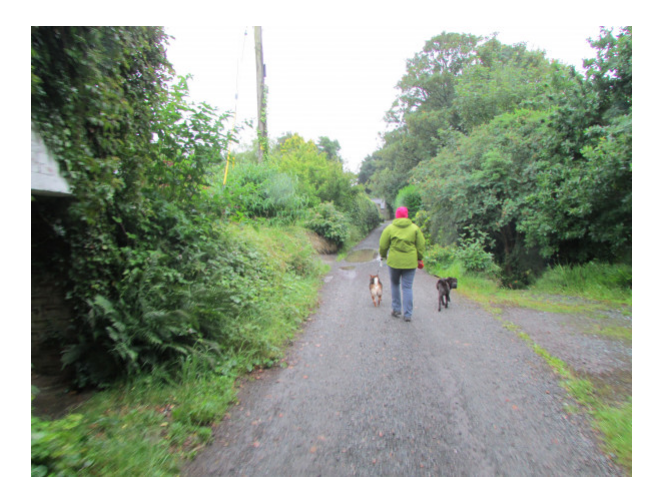
The track to the A497

2) Cross the road to reach the track and footpath sign. The track forks straight away and you should take the left branch behind the houses. Follow the track to exit through a gate to reach the A497.