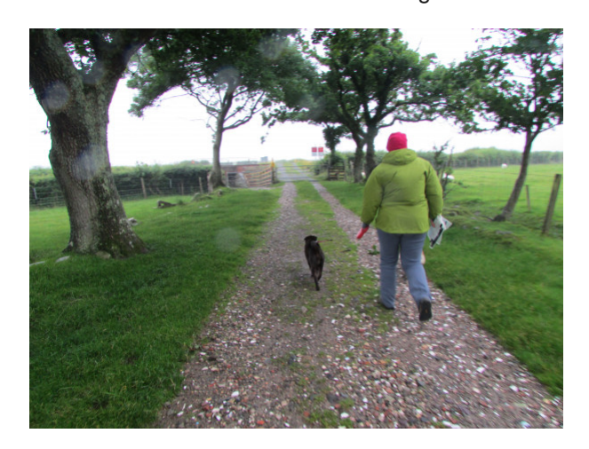
Approaching the level crossing

3) Cross the road carefully and take the Coastal Path ahead passing a sign for Aber Kiln. Go past a car park on the right and go through a gate to take a rising track. Continue to the end of this, passing through buildings and houses. When you reach a gate, go around it via a smaller gate and steps on the right. Continue ahead, picking up the track again, and at the next gate go left to pass through a smaller gate in the field corner. Cut back right to continue on the track. Follow the track around to the right and cross a railway line carefully via two stiles and a level crossing.