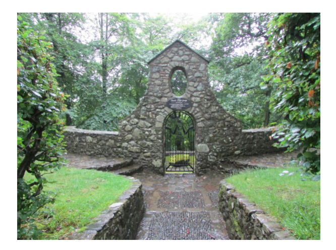
The Lloyd George memorial and grave

10) Proceed into Llanystumdwy to re-join your outbound route by the bridge in the village. If you go right over the bridge you can follow your outbound route back to the Club Site. If you fancy a pub stop at the Feathers Inn, it is a short walk to the left past The Lloyd George Museum.