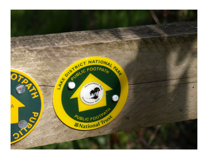
The sign to watch for throughout the walk