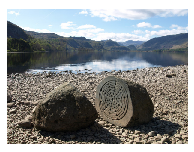
The Centenary Stone

Continue down steps to go right through a gate. Follow the path curving left around a bay to cross a bridge and go right over another bridge. Go left through a gate. Follow a path through woods to pass by a gate to a track junction. Go right signposted 'To The Lake'. Pass a house right and go past a cattle grid (gate). Curve right through an open meadow going left at a fork passing right of cottages. Follow the desending path soon curving left and pass 'The Millenium Seat' in trees. Descend to the lake shore and pass the Centenary Stone, which was created to celebrate 100 years of the National Trust.