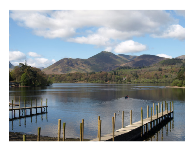
One of many views of Derwentwater on the walk

START - From reception at Keswick Club Site head down the access lane to go left at the end for a short distance to go right up steps and right again to walk up the road (The Headlands). This becomes 'The Heads' and when the road bends left go right past a green café heading for 'The Lake'. Follow the surfaced track through Hope Park to join a road going ahead and curving right to pass the Theatre By The Lake and reach the boating piers at the end of Derwentwater.