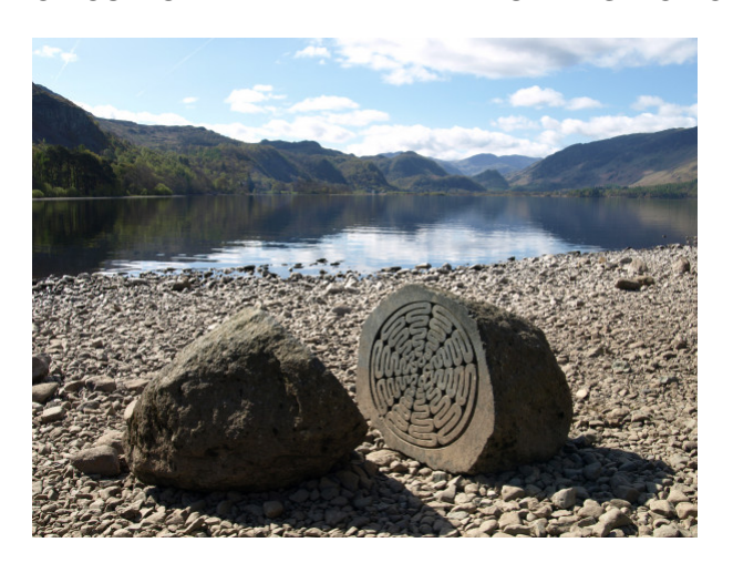
Views like this are common on this walk

The round of Derwentwater is a long stretch of the legs – if using a GPS it will show you it is 10.2 miles/16.41km – but every step of it is a joy, and the strenuous outing will take about 4.5 – 5 hours. The views are stunning and paths are generally good and easy to follow, but you should take Ordnance Survey OL Explorer Map 4 - The North Western Lakes all the same. Save this outing for a clear sunny day when the lake and the surrounding fells are at their very best and avoid it in wet and windy conditions – if there has been a lot of rain it is possible some of the lakeside paths may be flooded. Apart from that wear boots, take a rucksack and a packed lunch and go and enjoy one of the Lake District's classic low level walks.