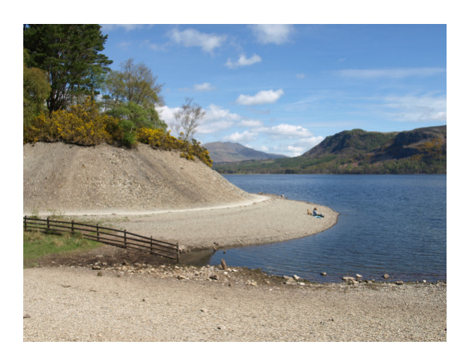
View of Brandelhow Bay