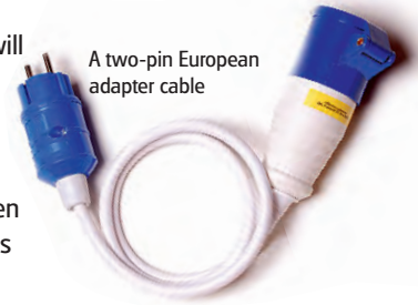
A two-pin European adapter cable

The available power from continental hook-up points will often be less than the UK and a supply as little as 5A or 6A is common.