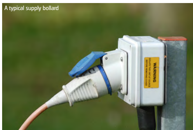
A typical supply bollard

At Club Sites the supply cable plug is simply a push fit into the bollard socket, but you will find some sites with hook-ups that require the plug to be pushed in and then twisted. With this type of hook-up a button has to be pressed to release the supply cable plug.