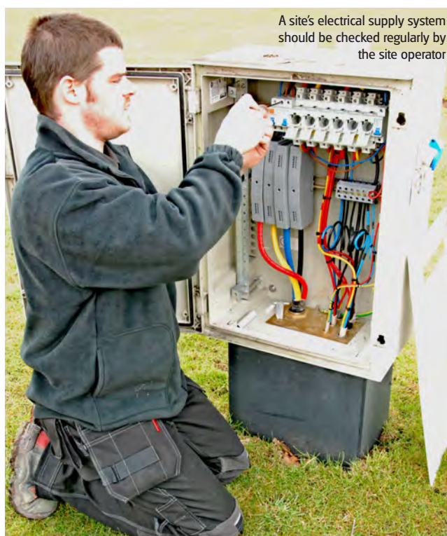
A site's electrical supply system should be checked regularly by the site operator

This electrical supply can be used either directly to power 230V equipment or indirectly via a power supply unit that converts the mains power at 230V AC to a nominal 12V DC, usually in conjunction with a leisure battery. This Data Sheet looks at how to use this electricity supply safely and discusses its limitations.