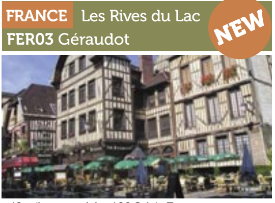
12 miles east of the A26 Calais-Troyes motorway and 14 miles north of the A5 Paris-Troyes motorway; Troyes 16 miles • Lakeside woodland setting, one mile from village • Lake fishing nearby • Great for birdwatching • Heated wash block, hot water to basins and showers • 186 pitches • Pitches all with 5A electricity • Bread delivery • Washing machines, drier Motorhome service point • Bar restaurant and shops one mile

• Electricity (10A): Included • Dogs/Cats: Free • Extra car: Free • Tourist Tax: Included • Apr prices available Oct 12