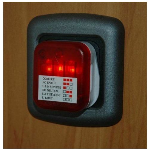
A proprietary mains tester can be useful when camping abroad

system will need to be checked by a suitably qualified person. As an extra check – especially if you are camping abroad – you can plug a proprietary mains tester into a socket to check the polarity of the supply and the presence of an earth connection (see Camping on the continent).