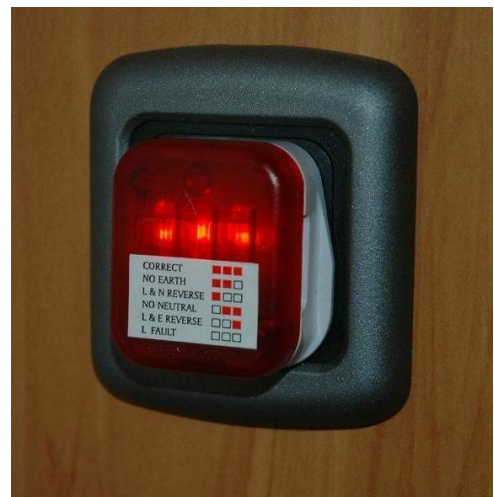
A proprietary mains tester can be useful when camping abroad

When you are ready to connect to your hook-up, make sure the RCD is in the off position and then connect your hook-up to your unit. Only then should you connect to the campsite hook-up outlet. It is good practice to check the operation of the safety RCD device before turning on your appliances by switching on the RCD and pressing the test button. If it fails to operate the system will need to be checked by a suitably qualified person. As an extra check – especially if you are camping abroad – you can plug a proprietary mains tester into a socket to check the polarity of the supply and the presence of an earth connection (see Camping on the continent).