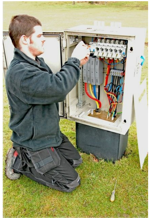
A site's electrical supply system should be checked regularly by the site operator