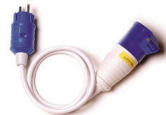
A two-pin European adapter cable

The available power from continental hook-up points will often be less than the UK and a supply as little as 5A or 6A is common.