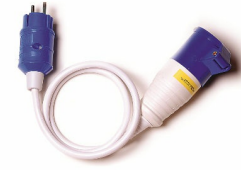
A two-pin European adapter cable

The available power from continental hook-up points will often be less than the UK and a supply as little as 5A or 6A is common.