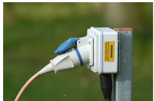
A typical supply bollard

The MCB is a device to protect the site cabling from overloading and limits the amount of current you can draw from the supply. Hook-ups on Club sites have maximum ratings of 10A or 16A and this will limit the number of appliances you can use at one time (see the How much power section). The RCD is designed to cut off the supply if a fault occurs in your connecting lead, caravan or other camping unit. However,