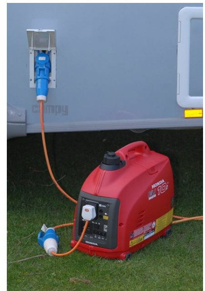
A generator providing power to a caravan

A generator must always be used outside because of the danger from exhaust and carbon monoxide. Always place it downwind and make sure the fumes do not go directly into other camping units. You will probably need to have a ventilated housing to shield it from rain and help keep the noise disturbance low. Do not forget the exhaust end of the generator will get very hot and can be a hazard to children and animals and give risk of fire if it is near long grass or other flammable material.