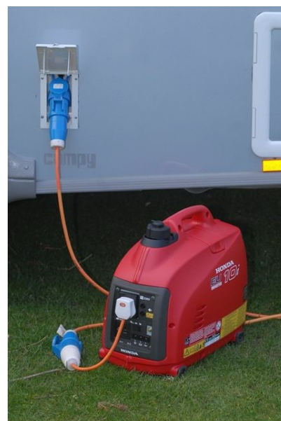
A generator providing power to a caravan

Normal electrical safety precautions are still vital as 230V is being generated, but there is the additional complication that a generator may not be compatible with a caravan supply system as the generator may not have an earthed supply as provided by a conventional hook-up. Before proceeding with a generator purchase, speak to your generator supplier and caravan dealer.