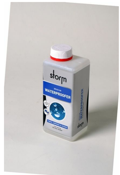
A waterproofing product

The DWR can become less effective over time for a number of reasons. For example, it can degrade in sunlight or be damaged if the fabric rubs against a rough surface. If the coating fails, water will start to soak into the fabric (darkening it) and it's time to consider re-proofing your tent.