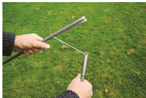
If you discover a bent pole, be sure to fix it before your next trip