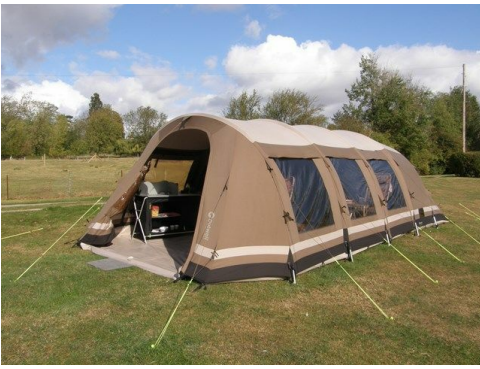
A polycotton tent

If you find the zips on your tent are getting a little difficult to open and close, you can buy a lubrication spray to get them moving again. Rubbing the wax of a candle into the zip should have the same effect. This is definitely worth doing before that first zip breaks. Likewise, if the seams of your tent show any signs of letting in water you can seal them using a proprietary seam sealant. Make sure the sealant is completely dry before packing your tent away to avoid the wrong bits of fabric sticking together.