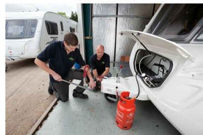
Servicing a hitch

These workshops have a range of specialist equipment that most owners will not have access to, such as a ramp, special tools and gas and electrical testing equipment. It is recommended that you have the caravan serviced at least once a year - or more often for intensive use - and that you also carry out regular basic user maintenance throughout the year. Manufacturers- warranty schemes generally insist on at least an annual service and most will accept a service done by an AWS member for this purpose, but check with you unit's manufacturer.