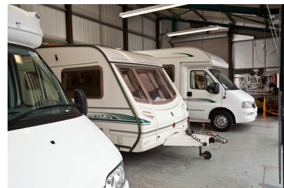
An AWS workshop

All AWS members follow the same nationally-agreed service schedule, provide clear menu pricing, a strict code of practice and also a dispute conciliation service. You will normally get a minimum six-month guarantee on all repair work and all members of the AWS are independently assessed each year for their levels of customer service. Some 65 separate checks are carried out by the AWS annual service, and details of the work undertaken can be found on the AWS website ( www.approvedworkshops.co.uk ) or by asking any member of the scheme.