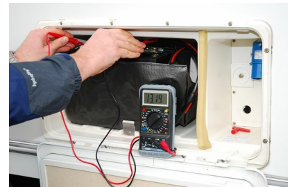
Checking a leisure battery

In addition, before connecting to 230V electricity supply, examine the cable, plugs and sockets to make sure they are not damaged and check the RCD test button works before switching on any device. If you have been using your van regularly during the winter, most of this will have already been done, but it is always a good discipline to run a few checks every time you take it out again, after even a short period out of use.