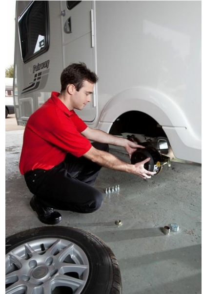
Servicing a caravan

Please note that the majority of AWS centres that handle motorhomes deal with servicing and repairs to the habitation area only and not the base vehicle.