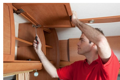
checking the fixtures and fittings

On completion of a service, an Approved Workshop will provide you with a service checklist that itemises all the points checked and will include advice and information on tyre condition and pressures. Remember tyres deteriorate with age and even though you may have plenty of tread left your workshop will advise replacement if they are more than seven years old (using the date marked on the tyre). AWS members will only carry out extra work or replace parts if they are safety related or with your specific permission, but always agree with your workshop how to deal with extra identified works. Some workshops operate on the basis of undertaking any additional work up to a value of say - 30, which eliminates the need for referral back for small items such as the replacement of bulbs. Approved Workshops will provide a detailed written estimate for works likely to exceed -150.