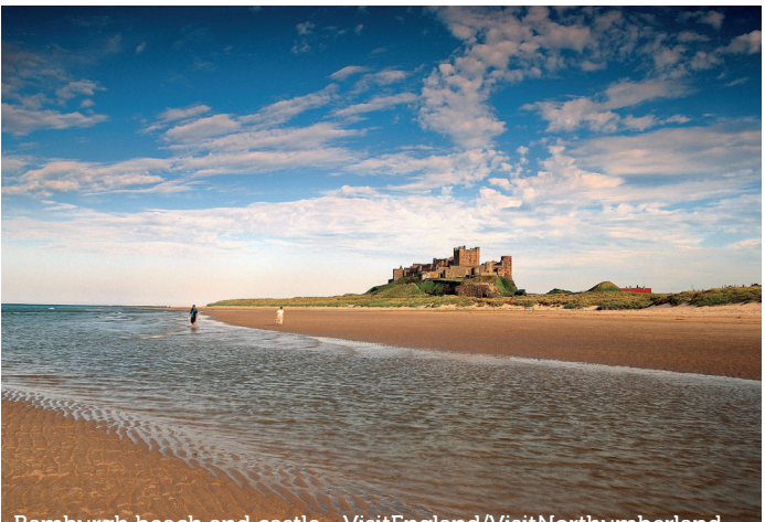
Bamburgh beach and castle