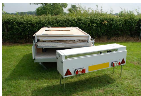
Open up your trailer tent to check it is in good order

A priority with a trailer tent is to unfold it as if pitching it to ensure there is no significant deterioration of the tent fabric and poles. Look for signs of vermin attack, mould growth and general wear and tear that you may have missed when it was last used. Use a sterilising solution (as used for babies' bottles) to kill any mould spores. For patching fabric or replacing guy lines, pegging rubbers or poles, repair kits and spare parts can be obtained from your local dealer or a specialist company (see Data Sheet 11 Looking after your tent).