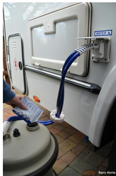
Add a proprietary chemical to disinfect your water system

Any water filter fitted will have a limited life and this is a good time to change it, but only after disinfecting, as filters will be damaged by the disinfecting agents.