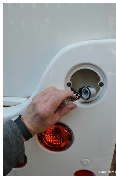
Sometimes cleaning the bulb contacts brings a light back to life

The electrical connection between towcar and trailer or caravan often gives rise to problems after winter storage, so it is always worth spending a few minutes to clean the pins and sockets. A quick spray with a water dispersant such as WD40 will help the cleaning process. Older seven-pin plugs and sockets may also benefit from light use of fine wet-and-dry paper to clean the exposed metal contact areas. Avoid the use of any abrasives on 13-pin plugs and sockets so you do not damage the rust-resistant finish on the pins.