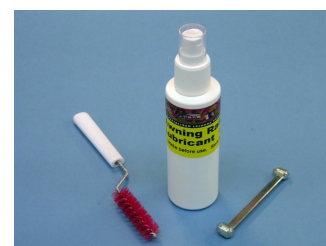
This simple kit can prepare your awning rail for the new season

Mechanical locks and security devices should be checked for functionality. Never lubricate locks with heavy oil or grease as this will attract dust and grit that can cause havoc with the mechanism. If a lock is stiff try a spray of fine lubricant that is unlikely to leave much residue behind. For locks showing signs of corrosion, which can be white powder deposits, a specialist graphite lock lubricant may be better. If in doubt contact your dealer or lock manufacturer. For electronic alarms simply test for functionality as per the manufacturer's instructions