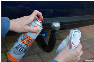
Clean a dry towball with brake cleaner

Grease on the towball and hitch attracts grit, so it is worth cleaning both and applying fresh grease at the beginning of the season. A dry towball (used with some types of stabiliser hitch) should be cleaned with brake cleaner and