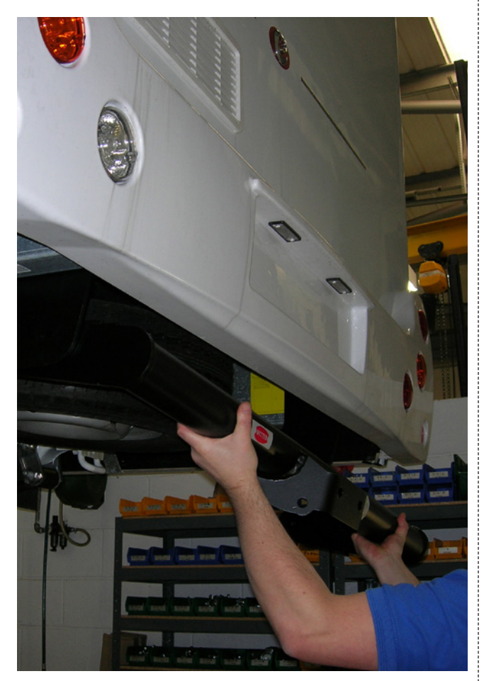
A towbar being fitted to a motorhome

Sometimes there can be complications with underslung water tanks or other equipment impeding the satisfactory fitting of a towbar. A towbar fitter specialising in motorhomes is therefore recommended, especially where a chassis extension or towbar needs to be fabricated for the particular requirements of your motorhome.