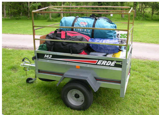
A typical unbraked trailer

For coachbuilt motorhomes be sure to use the convertor's plate (or AL-KO plate where the base vehicle rear chassis has been substituted with an AL-KO chassis) in case the original specified loadings as indicated on the base vehicle manufacturer's plate have been amended. The top figure on the plate is the vehicle's Gross Vehicle Weight (GVW) and the second figure down is the gross train weight (GTW). The GTW is the maximum combined weight of towing vehicle and trailer that is permitted. The difference between the GTW and GVW is your towing limit when the vehicle is fully loaded.