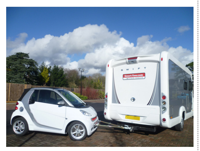
A micro car being towed by a motorhome

The current information sheet on this subject states: "We believe the A-frame and car become a single unit and as such are classified in legislation as a trailer." and "We believe the use of A-frames to tow cars behind other vehicles is legal (in the UK) provided the braking and lighting requirements are met". However on the Continent most countries still see it as a recovery tool and the DfT believes the Vienna Convention 1968 on Road Traffic cannot be used as a defence in disputes because the A-frame would not have been forseen at the time of the Convention.