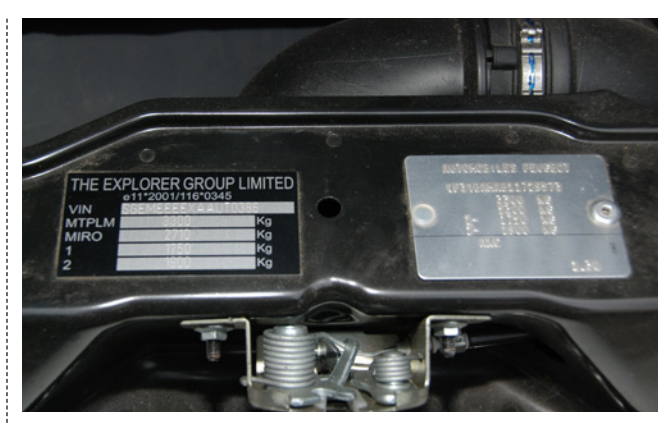
A base vehicle weight plate next to convertor's plate