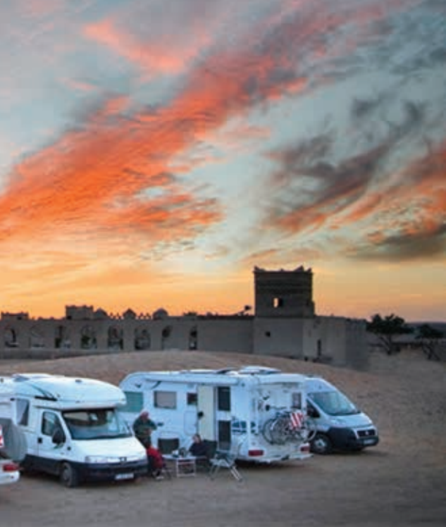
An overnight stop at the Erg Chebbi dunes

while longer. You could of course continue your homeward journey with the Tour Leader and support vehicle, which would necessitate an early start for the long, slow drive back up the coast. Most members will probably prefer to make their own way back, either alone or with other members of the tour. Any and all options and needs can be discussed fully and individually with the Tour Leader.