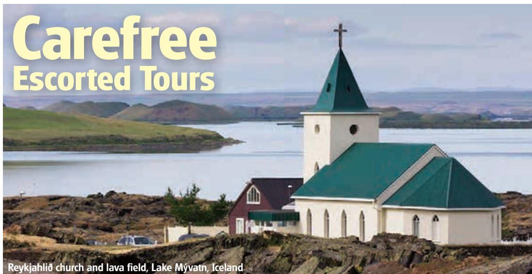
Reykjahlið church and lava field, Lake Mývatn, Iceland

Join in and enjoy one or more of Carefree's popular escorted tours – it's a great way to visit a new country or to give you a refreshing new look at a country you have previously visited. All of these tours are with your own unit, meaning that you have all of the comforts of home whilst enjoying travelling in a different country. All you have to do is be on the first site on the first day of the tour and you'll be welcomed by your Club Tour Escorts. You'll do and see far more than you would manage alone. Leisure days are built in too, so if you want to return to a favourite place, explore further or just relax on site you have the freedom to choose. Whichever tour you choose, you can enjoy the adventure in the good company of other Club members.