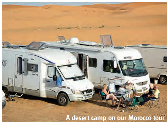
A desert camp on our Morocco tour

Join in and enjoy one or more of Carefree's popular escorted tours – it's a great way to visit a new country or to give you a refreshing new look at a country you have previously visited. All of these tours are with your own unit, meaning that you have all of the comforts of home whilst enjoying travelling in a different country. All you have to do is be on the first site on the first day of the tour and you'll be welcomed by your Club Tour Escorts. You'll do and see far more than you would manage alone. Leisure days are built in too, so if you want to return to a favourite place, explore further or just relax on site you have the freedom to choose. Whichever tour you choose, you can enjoy the adventure in the good company of other Club members.