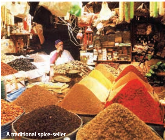
A traditional spice-seller

As early a start as possible is needed to cross the High Atlas