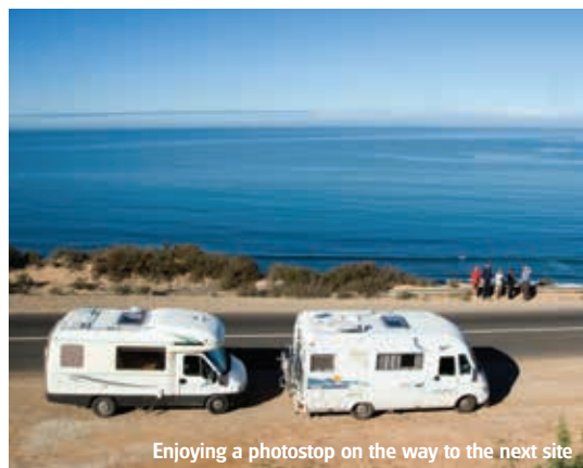
Enjoying a photostop on the way to the next site

Please note that mileages are approximate and indicated to give an rough idea of some of the distances involved.