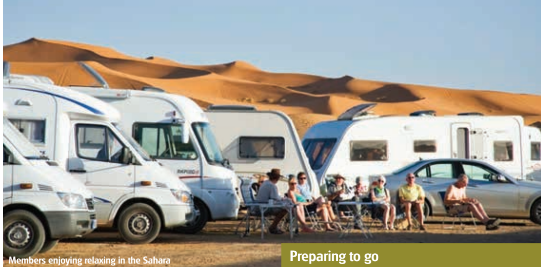
Members enjoying relaxing in the Sahara