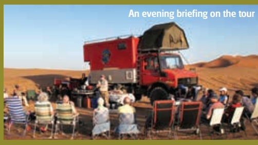
An evening briefing on the tour