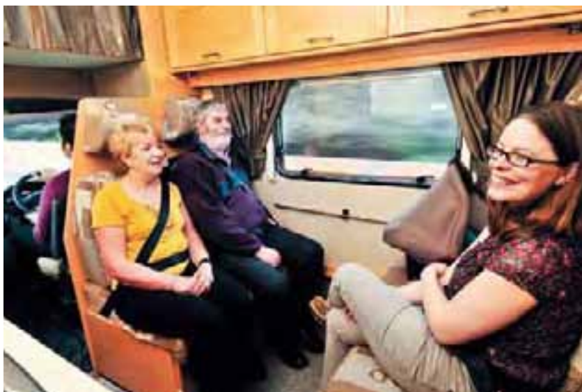
The Autoquest coped manfully with a full compliment of three adults and an infant

“We thoroughly enjoyed Mijas, a picture-perfect example of the gorgeous white towns that dot the Andalusian countryside”