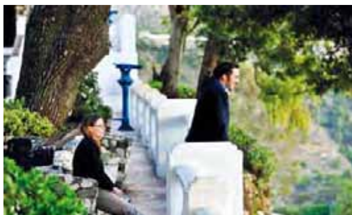
Enjoying the view from a terrace just off the town square in Mijas

From a pre-trip chat with one of the Club's site executives, I learned that British campers are in general favouring the Mediterranean coast rather than the southern Andalusian coast. Part of the trouble, it seems, is pressure on