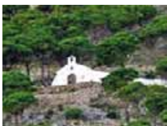
A white-washed church hidden away on a hillside near Mijas

For more information go to www.andalucia.com/golf