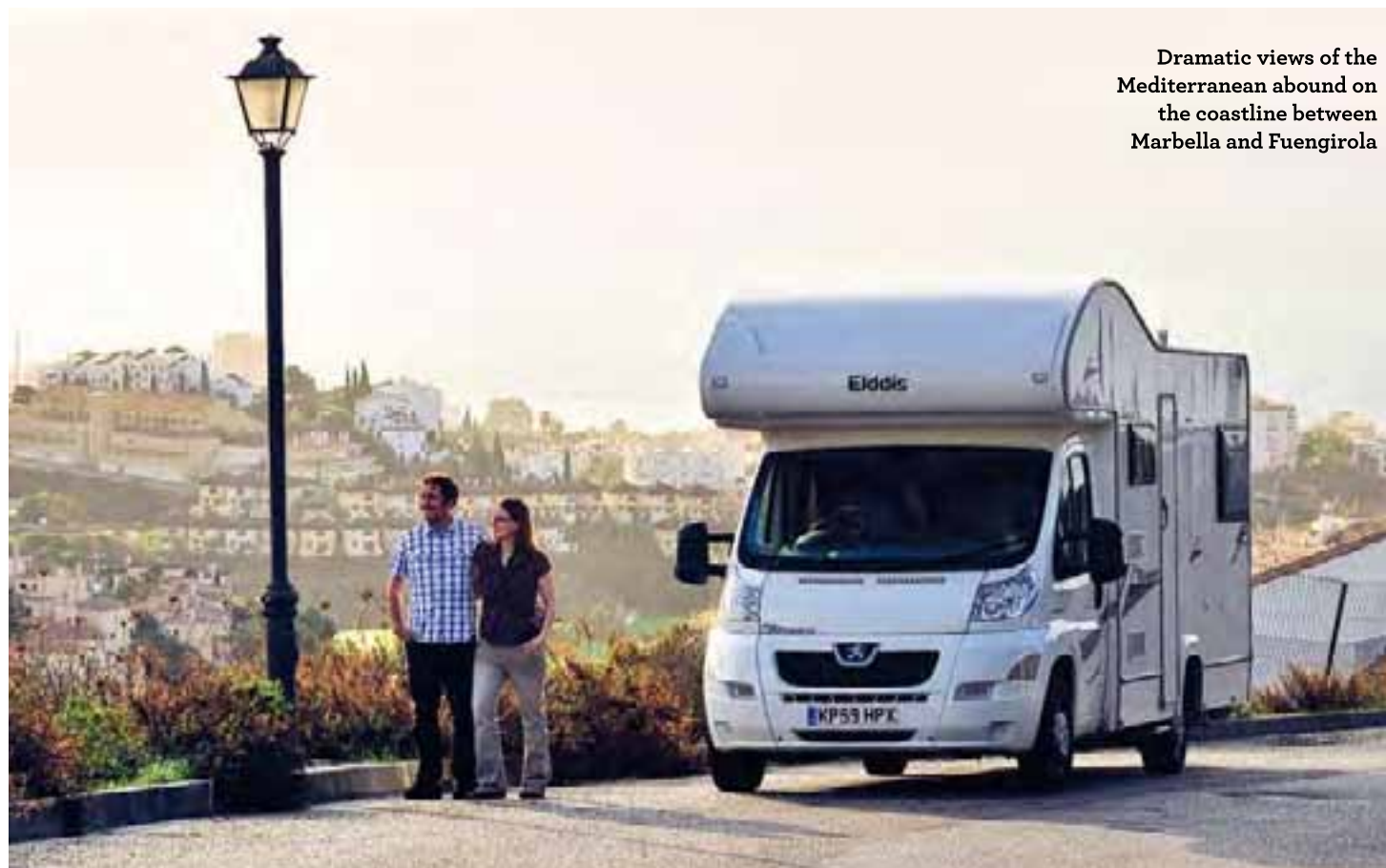
Dramatic views of the Mediterranean abound on the coastline between Marbella and Fuengirola

“Winding our way home, we enjoyed some fabulous coastal scenery as we stopped at Castillo de Baños, Cabo de Gata, Almafra and Playa Tropicana”